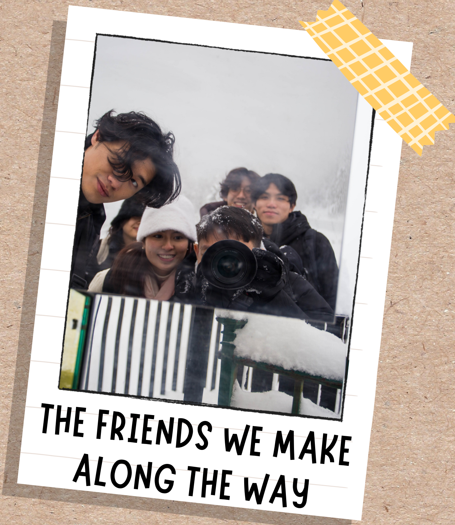
THE FRIENDS WE MAKE ALONG THE WAY